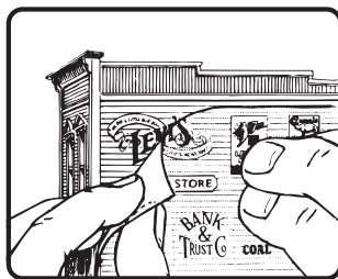
2. Lift away carrier sheet, carefully.