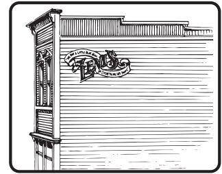
4. Finished Decal conforms to texture.

This item is not a Children's Product and is not intended for use by Children.