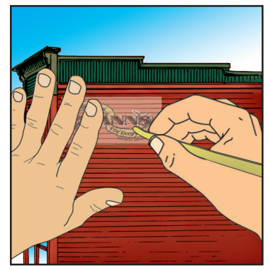
1. Position and rub Decal with Burnisher (DT600) or a dull pencil.