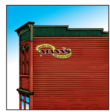
4. Finished Decal conforms to texture.

Conforms to Health Requirements of ASTM D4236