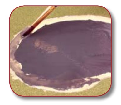
When painting a water area, use dark paint colors to model deep water and light colors to model shallow areas near the shoreline. (See Paint pg. 161)