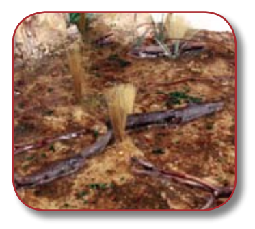
Model a swamp area with Realistic Water, Wild Grass and twigs.